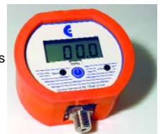
RB Rubber Boot Not for NEMA 4X models

Environmental Storage Temperature -40 to 203°F (-40 to 95°C) Operating Temperature -4 to 185°F (-20 to 85°C) Compensated Temperature 32 to 158°F (0 to 70°C)