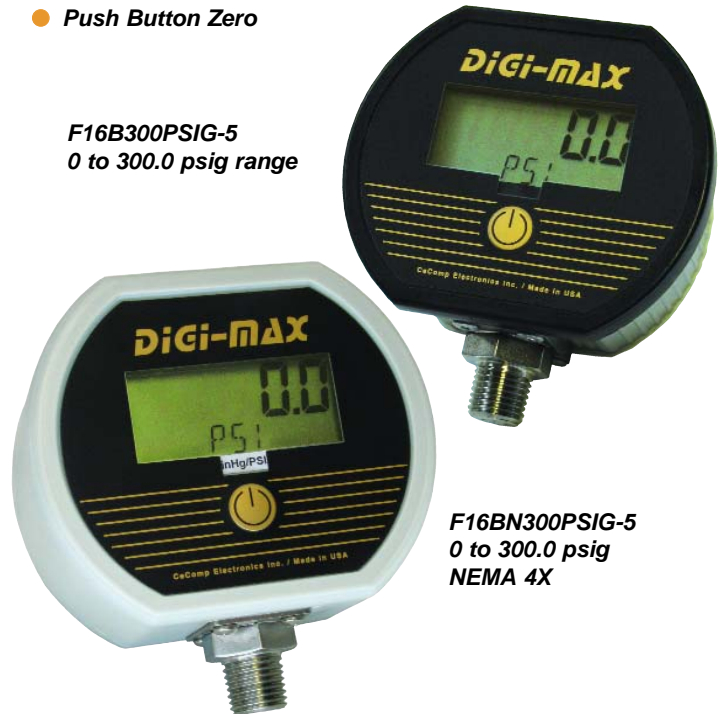
F16B300PSIG-5 0 to 300.0 psig range