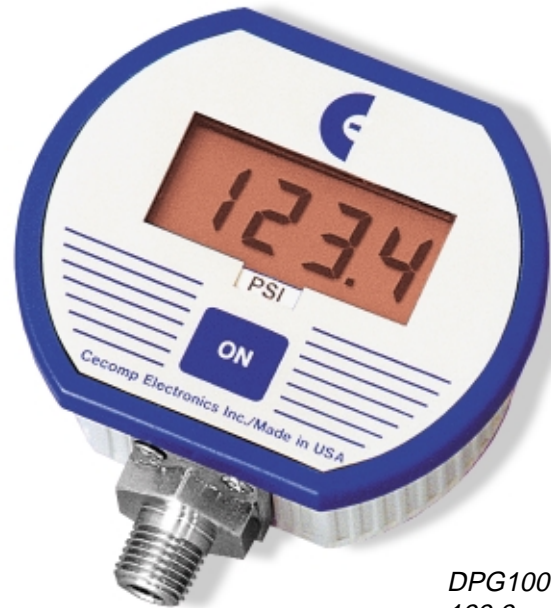
DPG1000BBL with 199.9 psig range