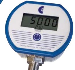
DPG1000B 4 Digit Ranges