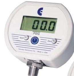
F4B, NEMA 4X