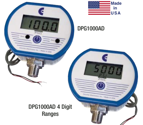
DPG1000AD 4 Digit Ranges