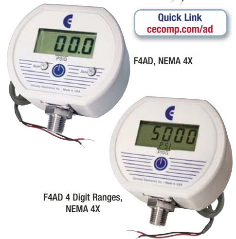
F4AD, NEMA 4X